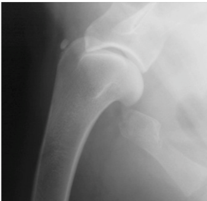
In this X-ray, the mineralization of a tear is at the upper left of the image.

"Getting to a diagnosis is really hard."