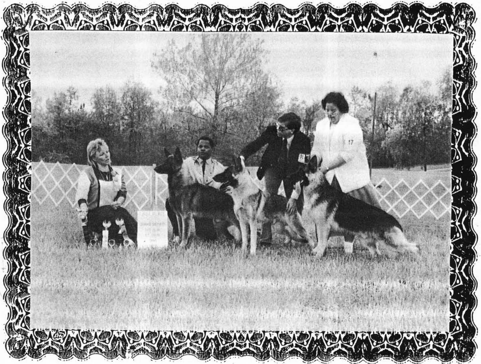
GRAUENHOF'S LOGAN, REVELSTOKE, ROYAL

OFFICIAL PUBLICATION OF THE GERMAN SHEPHERD DOG CLUB OF ST. LOUIS, INC.